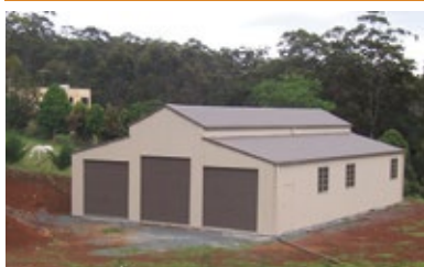
TRADITIONAL AUSSIE BARN

21m x 10.75m x 4.2m • 1 RAD 2.7mw x 3.0mh • 2 RADS 2.7mw x 2.7mh