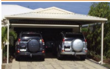
DUTCH GABLE CARPORT