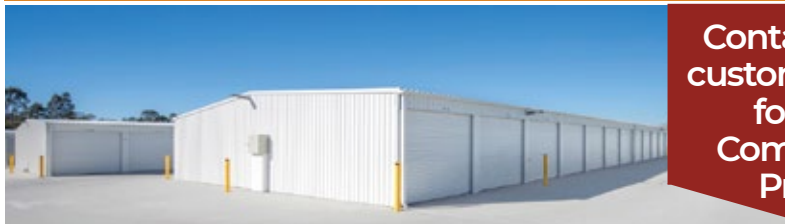
COMMERCIAL STORAGE SHEDS

Talk to our experts about designing tailor made storage units – to suit your business.