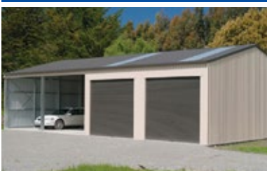
DOUBLE LOCK UP GARAGE

9m X 7.5m X 3m - Single Door Available in various sizes