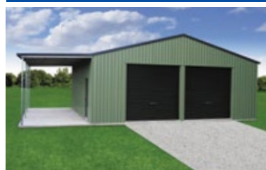
GARAGE WITH AWNING

12m x 6m x 3m Available in various sizes - Open or closed bays