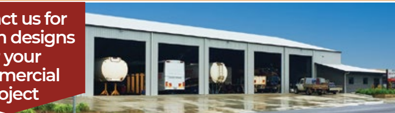
LARGE MACHINERY SHED

Contact us for custom designs for your Commercial Project