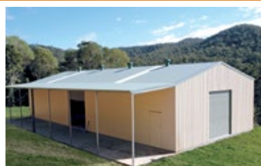
FARM SHED WITH AWNING

21m x 6m x 3.6m Available in various sizes